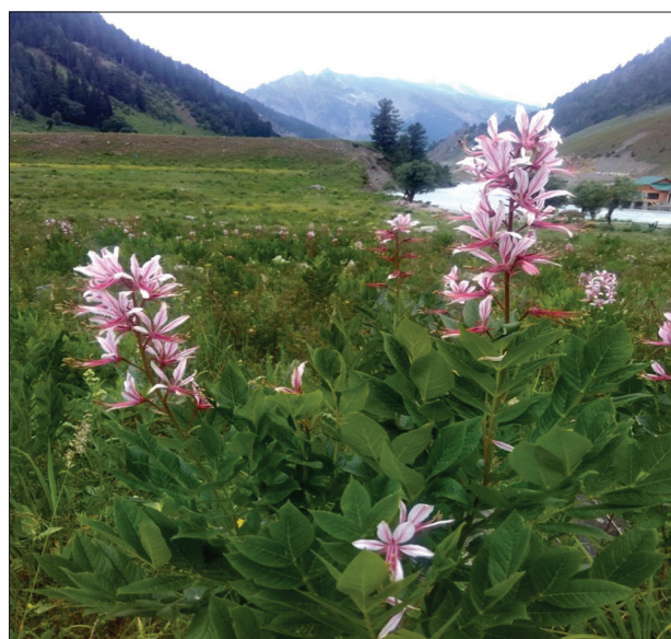
Figure 1: General morphology of Dictamnus albus

The present study depicts that plant height ranges from 114.1±15.96 cm to 137.7±15.18 cm. The study revealed that Sonamarg population shows shorter