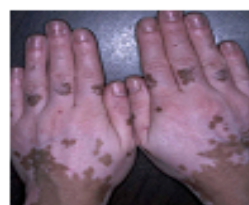
Fig. 6 Contact/Occupational