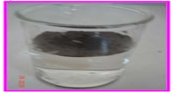
Figure 2: Varitara test for 60 put Naga Bhasma