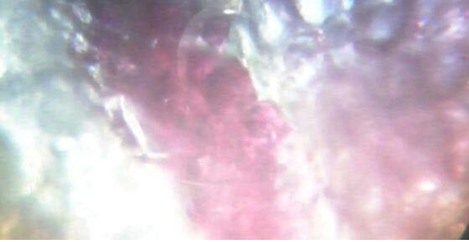
Fig E: prismatic and Clusture crystals