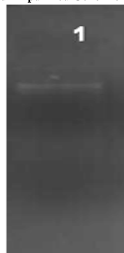
2 µl of DNA loaded was about 100ng

AMPLIFICATION: A cocktail was made with PCR master mix and respective Random primer