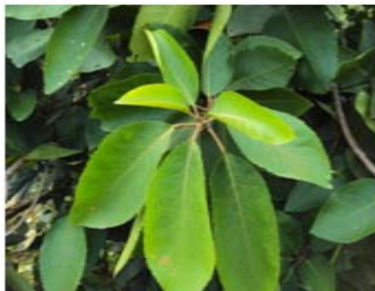
Colour of leaf upper green, lower pale green, Odour slightly aromatic and taste slightly bitter